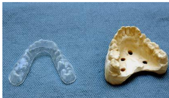
Juravinski Cancer Centre, Radiation Therapy Department (2011)

You may need dental trays. Your doctor will tell you if you need them. If they are needed, you will need to see a dentist prior to your radiation treatments to have them made.