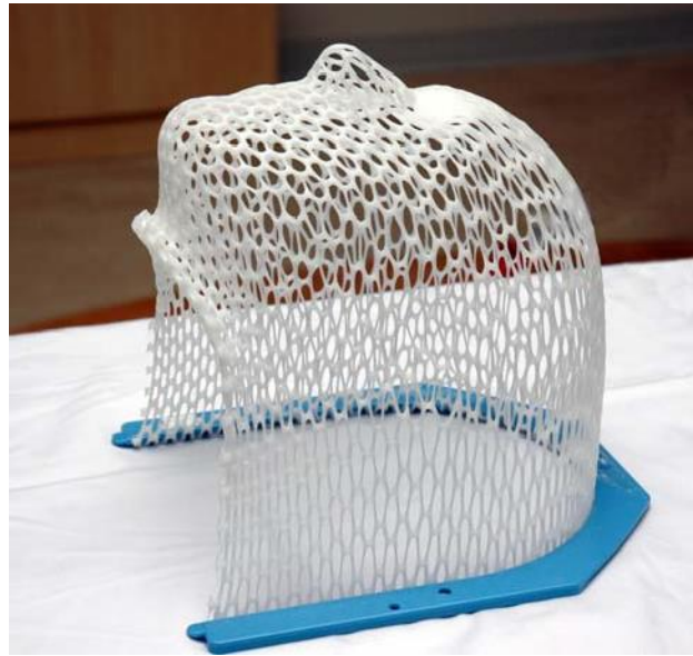
Juravinski Cancer Centre, Radiation Therapy Department (2011)

The mesh needs to dry for 15 minutes, so it will cool and harden. Then the mask is lifted off and allowed to set completely.