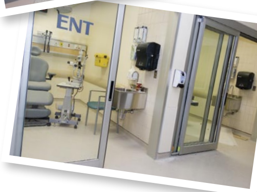
Above: Specialized treatment rooms include ear-nose-throat and casting.