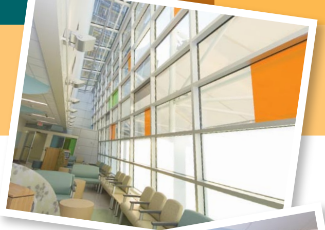
Right: Bright, open waiting area with interactive screens to distract children.