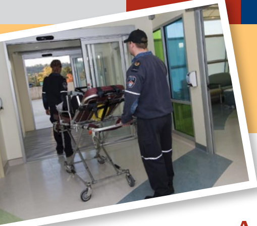
Above: A separate ambulance entrance helps to separate the more serious issues from those less severe.