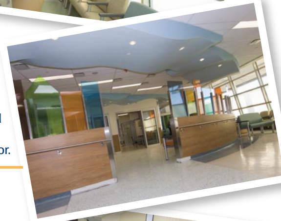
Middle: Entrance to Children's Emergency Department leads to nurse's "triage" area.

The Emergency Department is often busier at certain times of the day. It is usually busiest in the late afternoon and evening and often quieter in the morning.